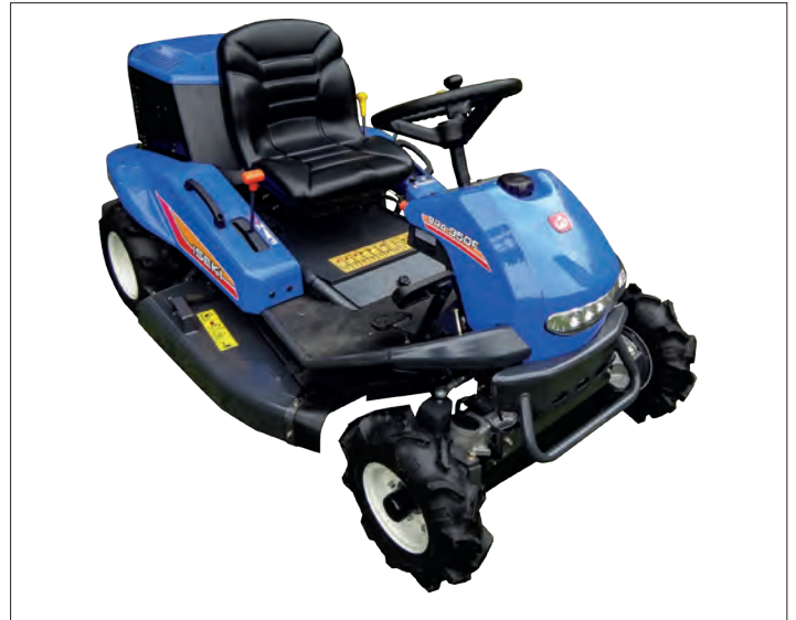
SRA950F 21hp 95cm width deck Slope capability 25° 4WD