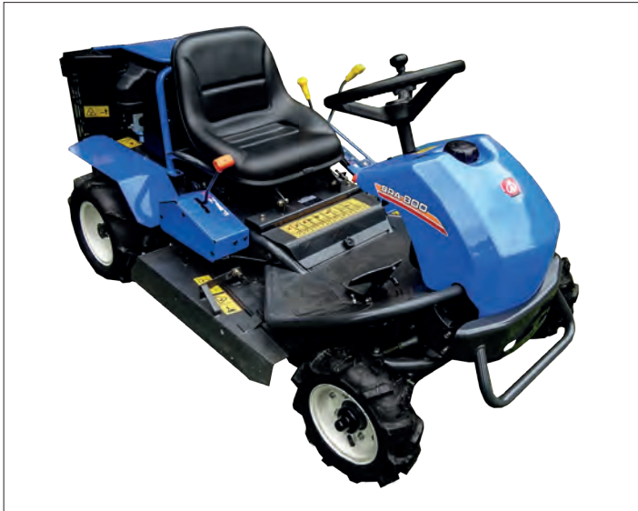
SRA 800 14hp 80cm width deck Slope capability 15° 2WD